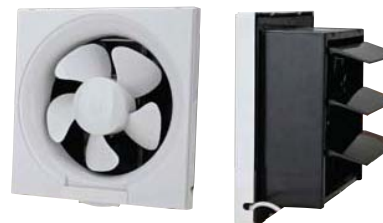
Model: APB20A2 APB25A2 APB 30A2

Names of Parts and Installing Dimensions(mm)