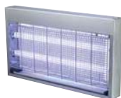
Model: GN1 (12W,16W,20W,30W,40W,60W)