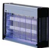
Model: GB-UNIQUE DESIGN(16W,20W,30W,40W)