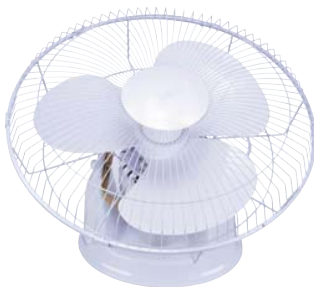
Model:FSLD-40 Fan head 360° rotating Wind speed: strong, medium, slow Design for comfort and peace